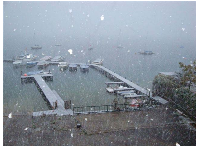
October's unseasonable early snow

We also encourage those that can to bring their winter sports' equipment so that it can be checked before Christmas. Equipment may be stored at school over the Christmas Holidays.