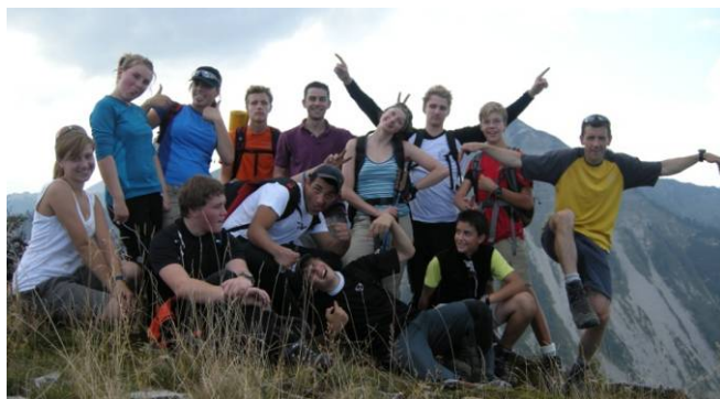
High on the hills for the weekend

Last weekend saw our students divided into three levels, with expeditions getting ever tougher for our older students. For the first time in the school's short history, our O.A.W. had warm and sunny weather and we can report successfully completed challenges at all levels.