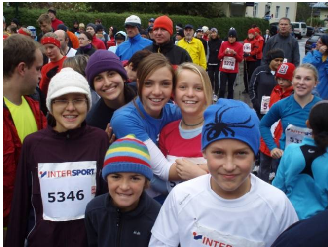
Running in the Wolfgangseelauf

Three racers completed the full 27 km category and three teams completed the 42.2 km team category.