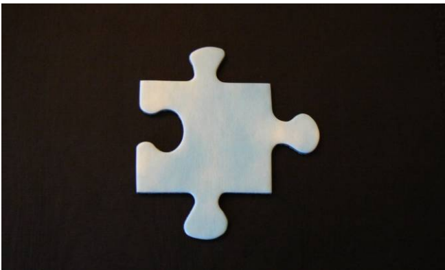
A puzzle, representing part of the school community