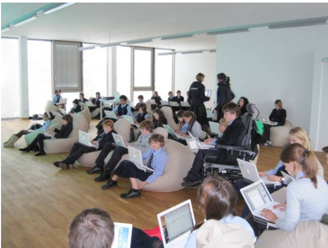
Students writing Report Comments in the Soft Space

Parents of new students should, by now have received their first telephone call or email from Mentor Tutors. Mentor Tutors meet with their tutees regularly for academic tracking, pastoral care and for social events including tutor evenings. Parents should be reassured that each student is allocated to a Mentor Tutor who works closely with the relevant Housemaster or Housemistress.