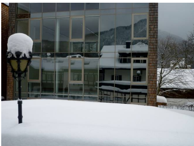
Perfect conditions on the morning of our Snow Day!