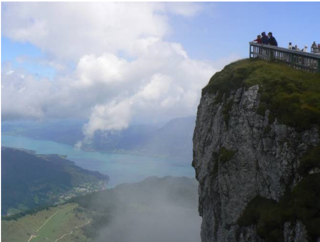
New students viewing the Salzkammergut

For new and returning Faculty the school year starts earlier than for our students with a lot of preparation for the new academic year. We are pleased to report that new staff completed their induction, including a team building boating activity. New students had an easier induction, enjoying a trip on the Schafburg mountain railway.